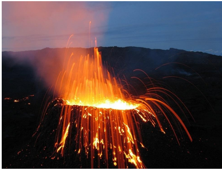
Piton de la fournaise